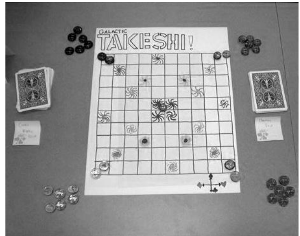
Figure 1. A board game created by the students, designed around the aesthetic of discovery. Players discover new planets based on the cards they draw.

To integrate the activities, each Structure class was started with a game demonstration. The game would be selected to highlight the topic of the class for that day (such as One Button Bob [2] to discuss game mechanics or Flower [24] to illustrate a focus on aesthetics), and was typically chosen from less well-known video games or even board games. This gave the students chances to see games they wouldn't normally come across, and in some cases, challenged their definition of a game. For example, some students had only encountered conflict-heavy games, and an exploration-based, sensory game like Flower sat outside of their preconceived notions of what a game is. During the lecture, the games were referenced and tied into the material, and at the end of the lecture, the students were given a design task which incorporated the concepts they had learned.